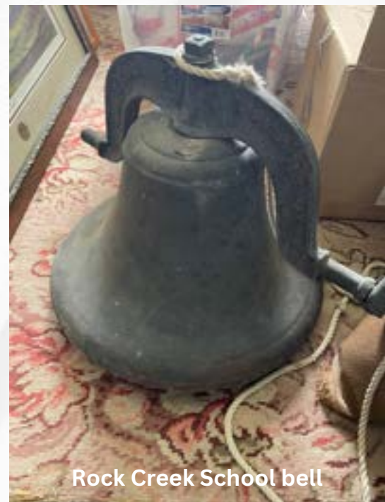
Rock Creek School bell