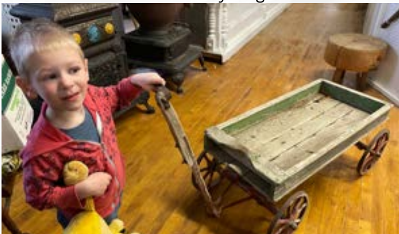
Stiltz Family Wagon